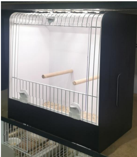
Show Cage Model 1: